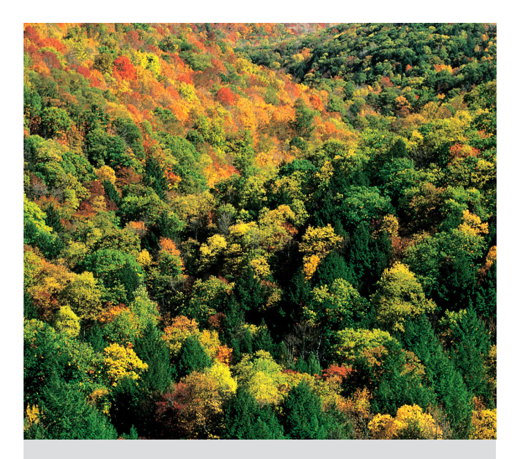
Certain Federal agencies have powers to enforce general environmental legislation on all forest lands

seek out and act on the views of the U.S. public.