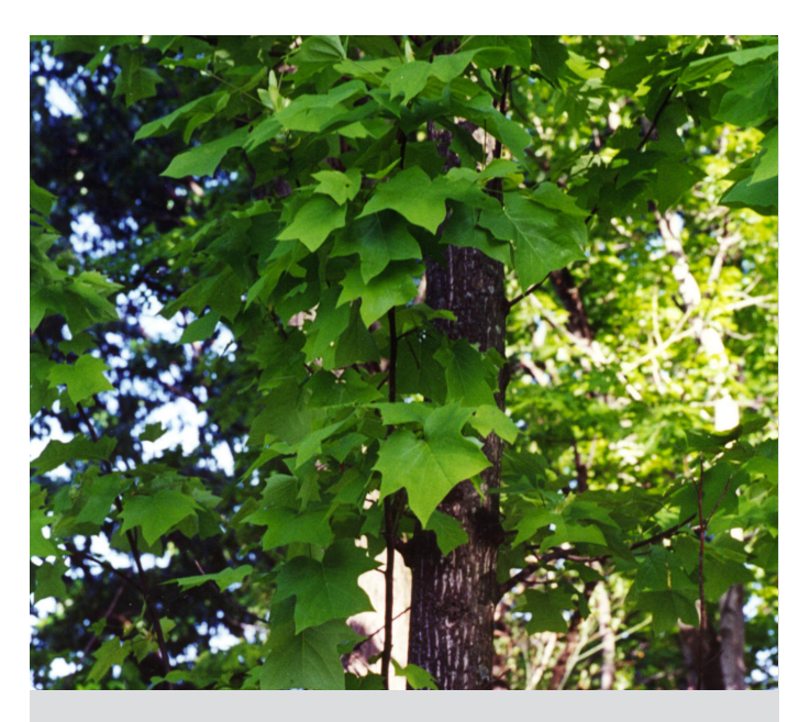
Voluntary private sector initiatives form a major component of the United States regulatory framework

the Lacey Act vary in severity based on the violator's level of knowledge about the product: penalties are higher for those who knew they were trading in illegally harvested materials.