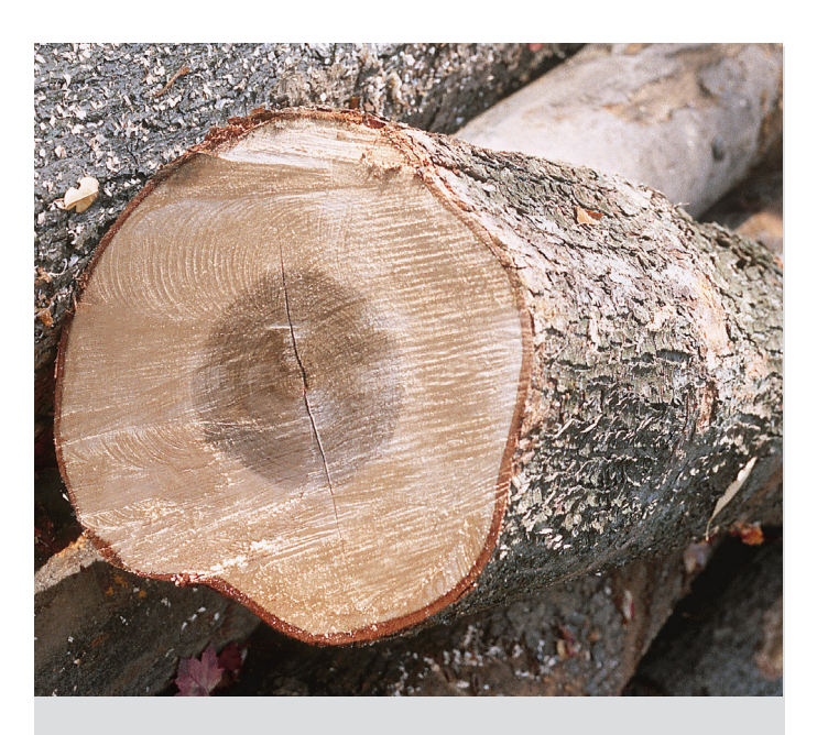
Forest ownership is in flux due to divestiture of forest industry lands and intergenerational transfer of family forests

While the total volume of trees standing in U.S. forests has continued to rise, urbanization and development are leading to forest loss and fragmentation in some areas. Forest quality has declined and pest outbreaks have become more widespread and damaging in many areas due to a combination of factors including years of strategic fire suppression and environmental restrictions on logging in forests owned and managed by the Federal and state governments, a decline in active forest management by non-industrial private owners, climate change, and invasive pests imported in wood packaging and other forest products.