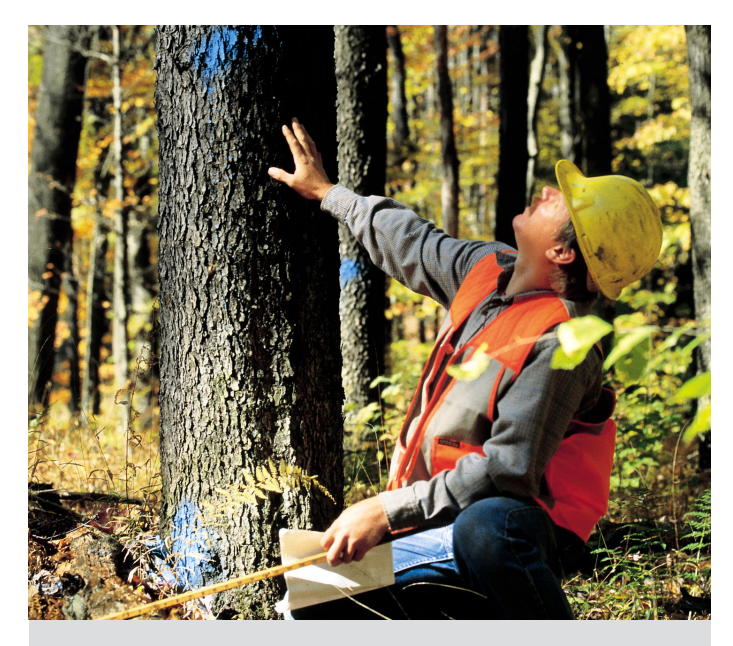
The federal government and state agencies have evolved far-reaching programs to enhance public-private sector cooperation

The Forest Stewardship Program, authorized by the 1990 Farm Bill and managed by the U.S. Forest Service, is the most extensive private