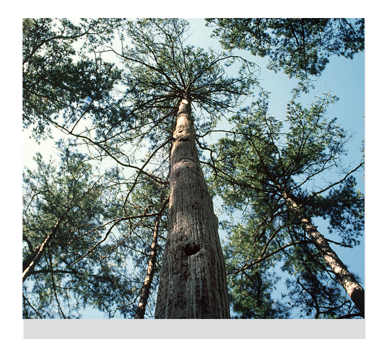
Much of the responsibility for forest regulation lies at State level

her property are essentially takings that require just compensation. As a result many states have chosen to introduce non-mandatory regulatory regimes encouraging good management through positive incentives and education rather than direct intervention and control.