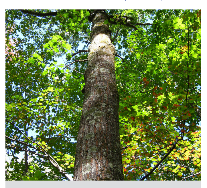
An Act of Congress from 1891 authorised the establishment of a system of National Forests

The U.S. Federal Government, through the U.S. Forest Service, retains direct jurisdiction over National Forests to this day. Over 32 laws are considered in the planning of forest operations on Federal timberlands, most notably the Multiple Use and Sustained Yield Act (1960). By law the Forest Service can only harvest as much as has grown and all forests must be replanted or renewed naturally. Further laws establish requirements for a comprehensive forest planning process during the management of National forests, including systems to evaluate forest resources and monitor operations, and to