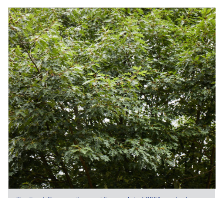
The Food, Conservation, and Energy Act of 2008 required that every state must complete a State-wide Assessment and Strategy for Forest Resources

In response to these new challenges and opportunities, the Food, Conservation, and Energy Act of 2008, also known as the 2008 Farm Bill, required that every state must complete a statewide Assessment and Strategy for Forest Resources. The Assessments provide an analysis of forest conditions and trends in the state and delineate priority rural and urban forest landscape areas. The Resource Strategies provide long-term plans for investing state,