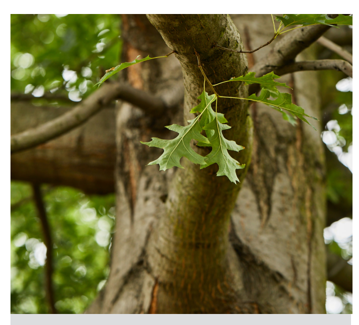
The 2000 Plant Protection Act regulates the import, export and interstate movemnet of plants and plant products

• The 2000 Plant Protection Act consolidated ten existing U.S. plant health laws into one comprehensive law. The Act gives the U.S. Department of Agriculture the authority to