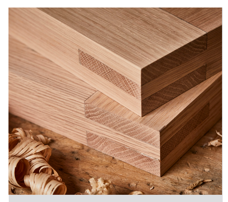
For further reading, visit the AHEC website

More comprehensive information on the U.S. forest regulatory system, together with an assessment of the risk of illegal and unsustainable harvest in the American hardwood sector, is contained in the Assessment of Lawful Harvesting & Sustainability of U.S. Hardwood Exports by Seneca Creek Associates which is published on the AHEC website.